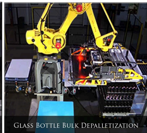
GLASS BOTTLE BULK DEPALLEITIZATION

Patent: US6658816 B1, US20100185329, US20090000415 | Ver. Oct. 2013